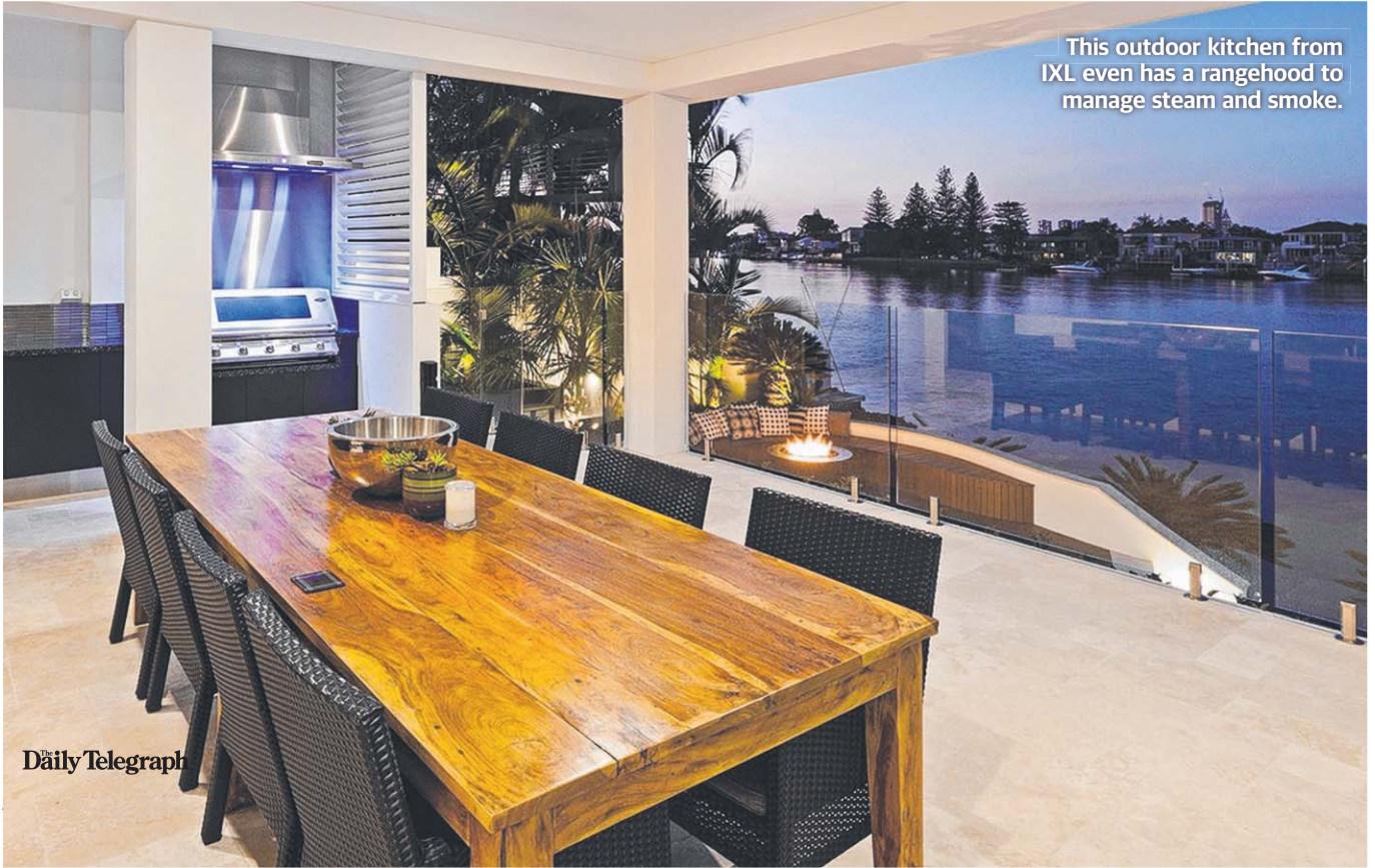
This outdoor kitchen from IXL even has a rangehood to manage steam and smoke.